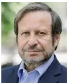
Steven Koonin Former Undersecretary for Science, US Department of Energy

Expertise: Hydrocarbon seep science & atmospheric chemistry